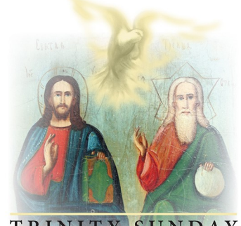
TRINITY SUNDAY Father son boly ghost